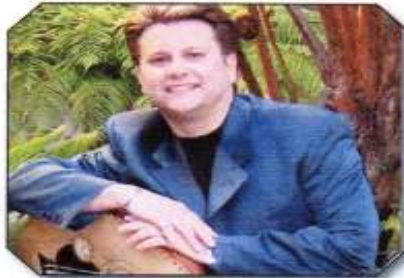
Singer MITCHELL KALTSUNAS