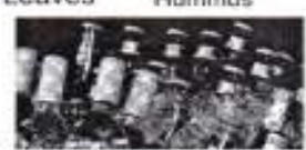
Full Liquor • Cash Bar