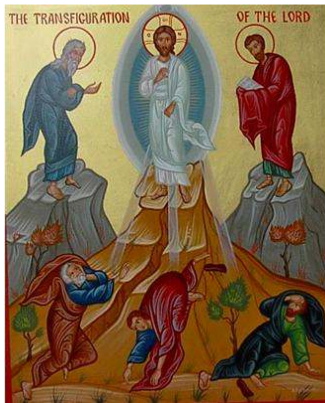
Transfiguration of Our Lord