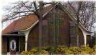
St. Anthony of the Desert Church 300 N. Eastern Avenue, Fall River, MA 02743