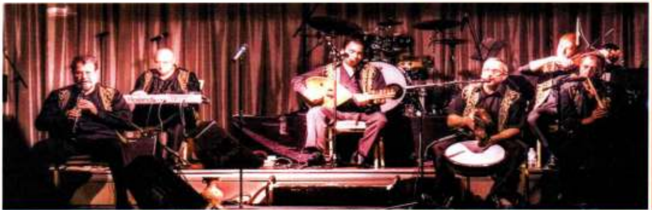
(Proceeds Benefit St. Maron Church Community)

Taste the Food . Meet the People . Enjoy the Atmosphere