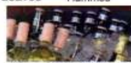
Full Liquor • Cash Bar