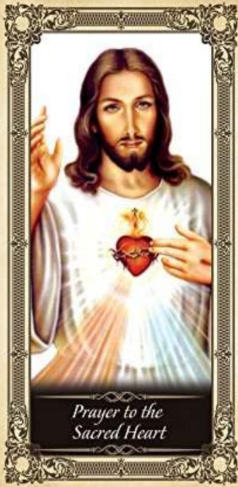
Prayer to the Sacred Heart