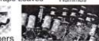
Full Liquor • Cash Bar