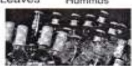
Full Liquor • Cash Bar