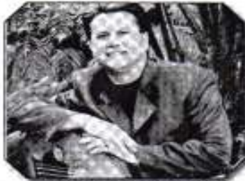
Singer MITCHELL KALTSUNAS