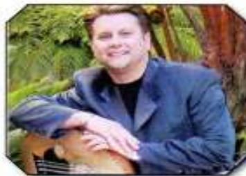
Singer MITCHELL KALTSUNAS