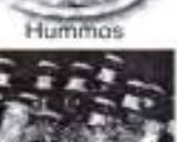
St. Theresa Dabke Group