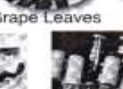
Full Liquor • Cash Bar