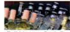
Full Liquor • Cash Bar