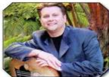
Singer MITCHELL KALTSUNAS